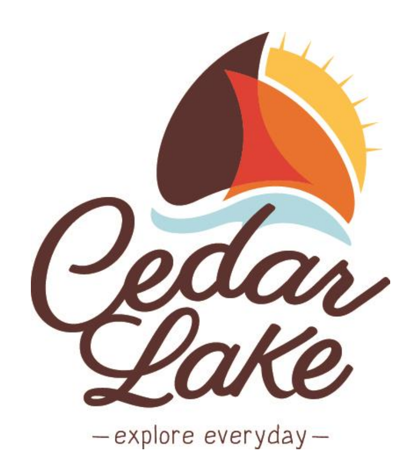
EXHIBIT "A" to Ordinance No. 1218

Ordinance No. 1218 was Passed and Adopted on April 21, 2015