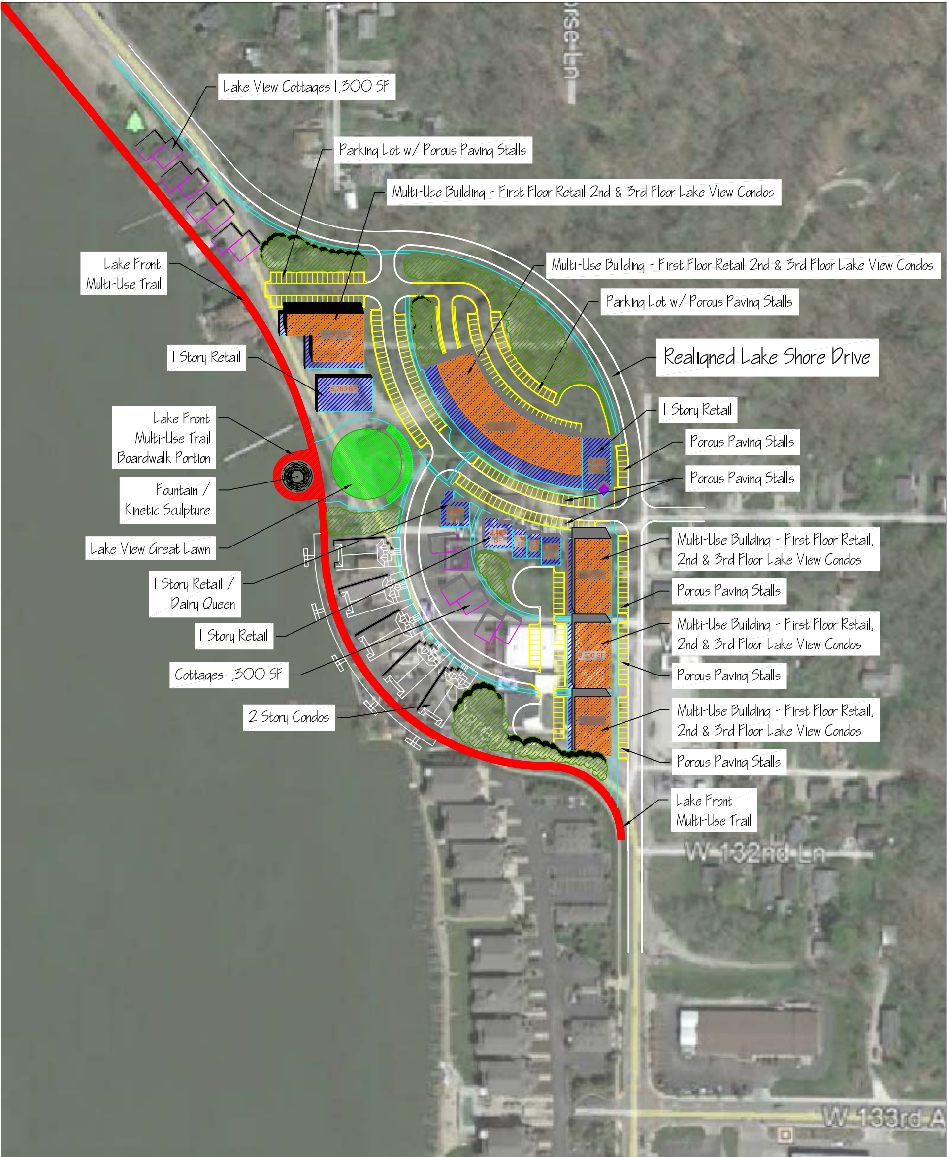
LIVABLE TOWN CENTER - CONCEPTUAL PLAN Cedar Lake, IN