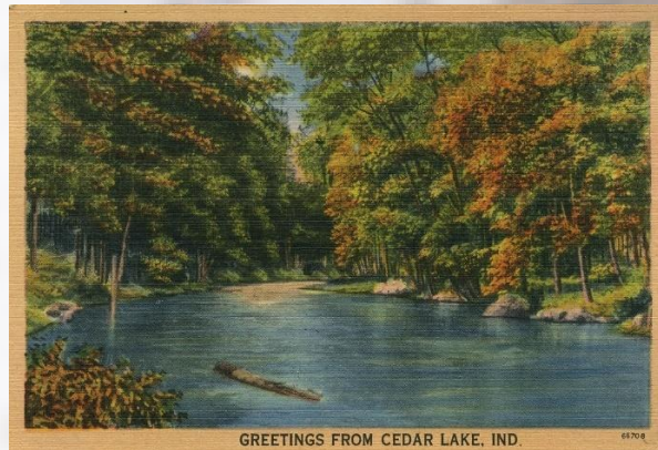
Cedar Lake Autumn Postcard, Circa 1946