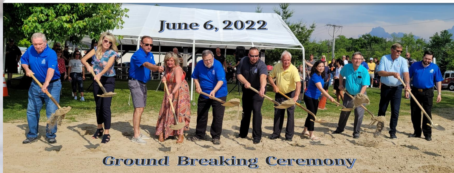
Ground Breaking Ceremony