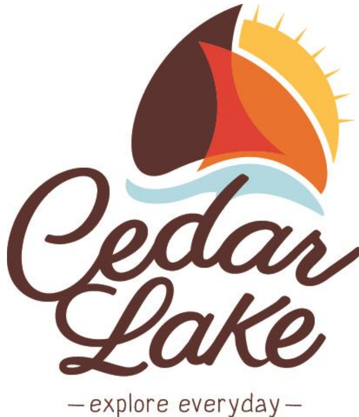
EXHIBIT "A" to Ordinance No. 1218

Ordinance No. 1218 was Passed and Adopted on April 21, 2015